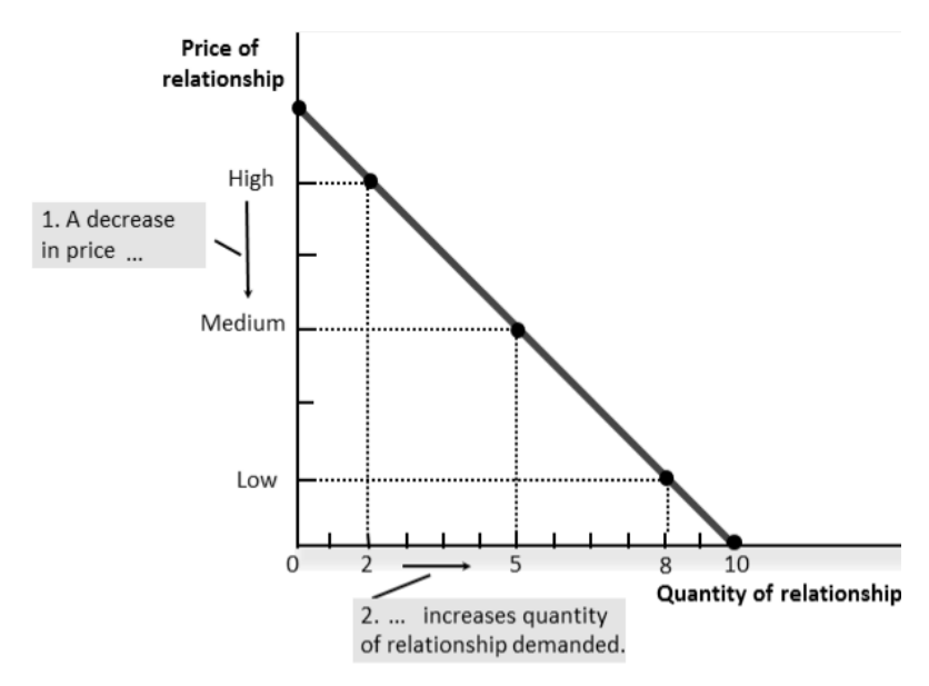
Figure 1. Demand for relationship: demand curve.

sketch a box in the origin of the demand graph. Undergraduates realize that they are illustrating the song graphically. Students must answer the next question: "What do you know about the change in the woman's demand for the relationship?" Students discover that the woman's demand curve shifts to the origin of the demand graph when they read the following lyrics: